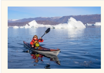
Kayak Skills Progression Camp (expert, 1 seaters)

470 USD 14 places left Basic kayaking experience is of advantage, but it is not a requirement. Physical fitness is essential. Kayaking is subject to weather and prevailing ice conditions.