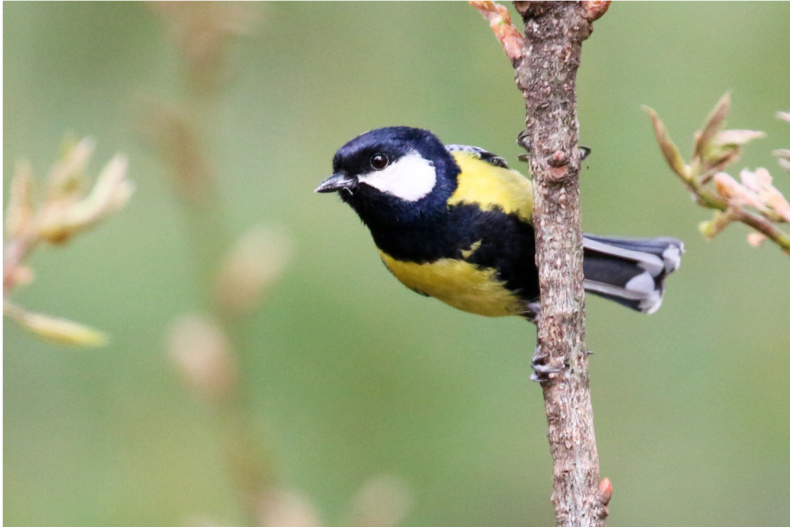
Green-backed Tit, a close relative of the Great Tit.

Day 18. Dec 14, 2024: Depart Bhutan. Transfer to airport and fly to Bangkok. It is possible that we will arrive approximately at 5 – 6 pm this afternoon. Once confirmed, some may choose to book the international flight out of Thailand tonight. For those who choose to remain the night in Thailand, we have not included the cost of hotel/food for this evening.