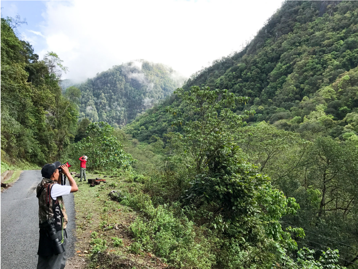
Birding in Bhutan.