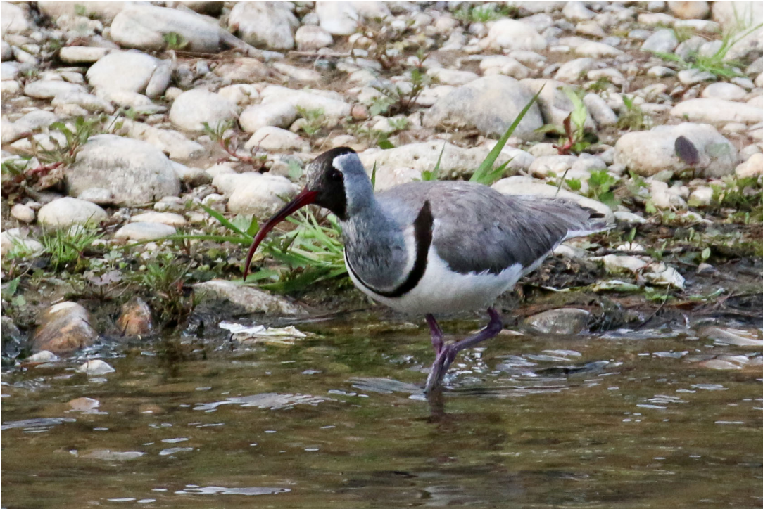
The unique Ibisbill, common in Bhutan.

Alvaro's Adventures is returning to Bhutan. It is a fantastic trip, to watch birds and visit the Himalayas and the distinctive Buddhist culture of Bhutan. We will team up with expert local birding guides to offer an authoritative, yet distinctly fun and informative tour of the birds and natural areas of Bhutan. This promises to be a highlight for any birder interested in seeing one of the most distinctive of countries and cultures. We will incorporate some time to visiting temples and areas of cultural importance.